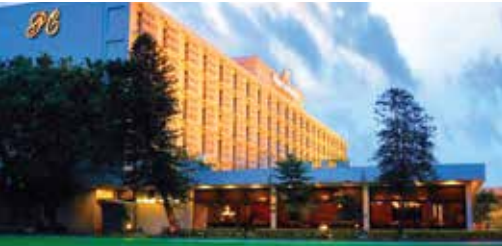
(Islamabad ) Rawalpindi Pearl Continental Hotel