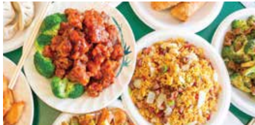
@ Chinese Food