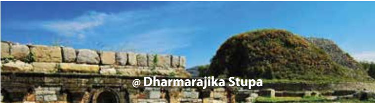
@ Dharmarajika Stupa