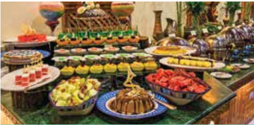
@ Gilgit Serena Hotel Buffet