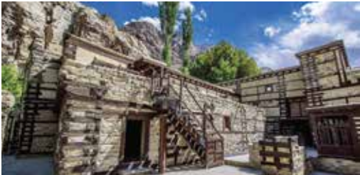
(Skardu) Skardu Serena Shigar Fort