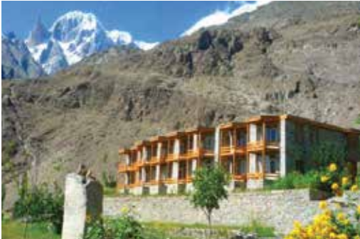
(Duiker) Egale Nest Duiker