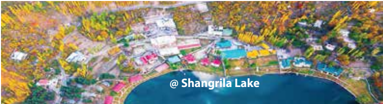
@ Shangrila Lake