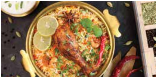
@ Pakistan Food