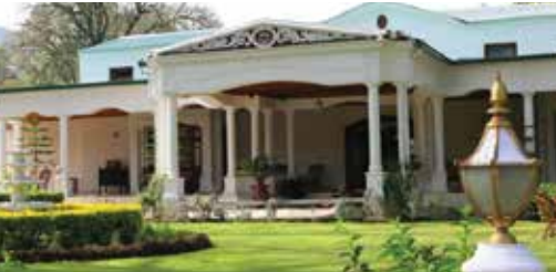
(Abbottabad) Swat Serena Hotel