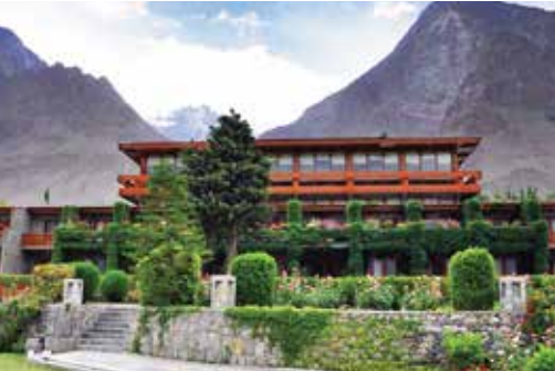
(Gilgit) Hotel Gilgit Serena